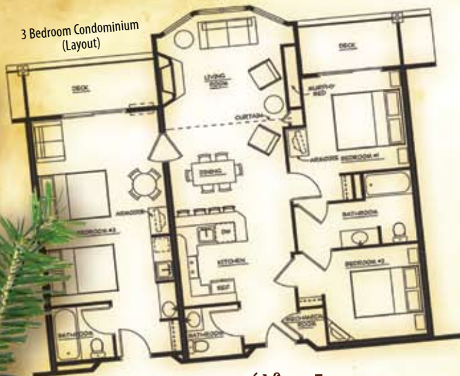
3 Bedroom Condominium (Layout)

(After 5 pm or on weekends, dial 4203 and leave a message.)